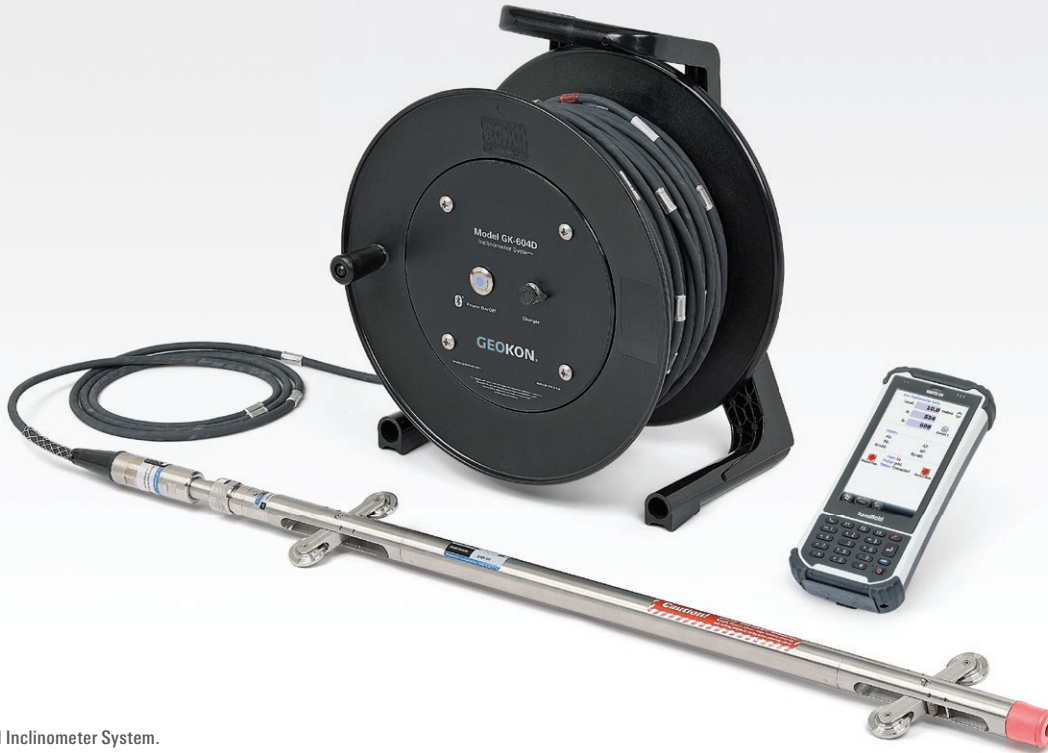
Model GK-604D Digital Incliner System.