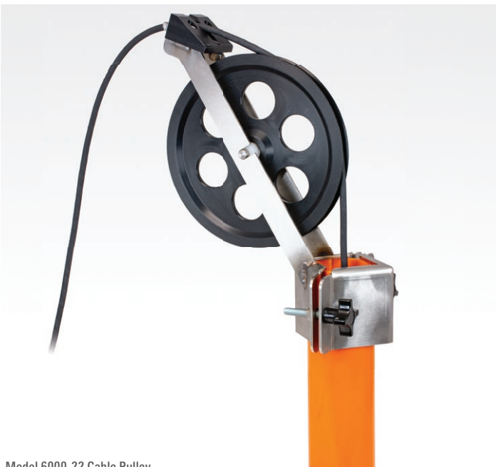
Model 6000-22 Cable Pulley

The difference of the two sets of tilt readings is then used to calculate the vertical profile of the inclinometer casing, which, when compared to profiles taken on different dates, will reveal the magnitude and location of any deflections occurring along the length of the casing.