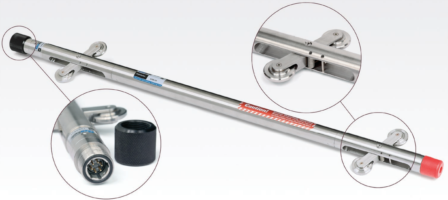
Model 6100D Digital Inclinometer Probe.