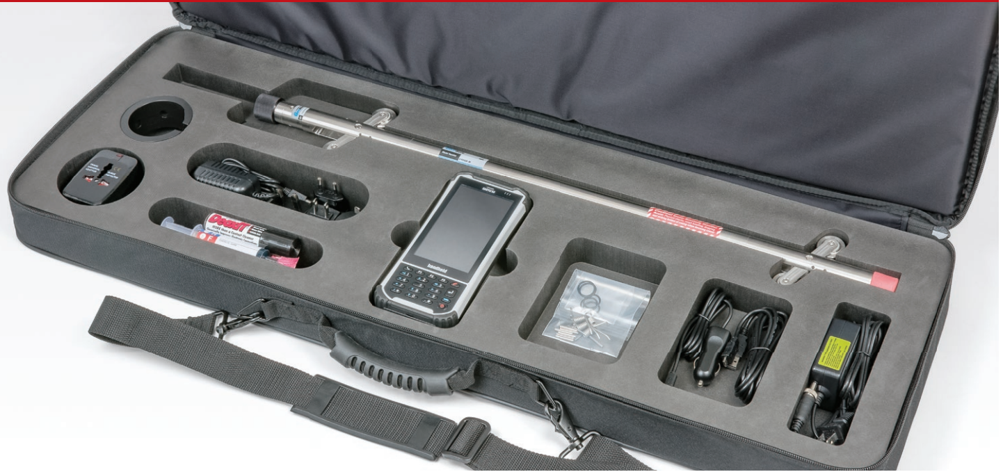
Model 6000-17 Cordura® Carry Case, with padded interior, is used to protect the probe, FPC-2 Field PC and accessories from shock during transportation. Case contents (top; left to right): Inclinometer Probe, Casing Adaptor for the Cable Pulley, Universal Power Adapter, Wall Charger for the Field PC, Deoxit Spray and Waterproof Grease, Field PC, Spare Parts for the Inclinometer Probe, Car Charger and USB cable for the Field PC, Cable Reel Charger.