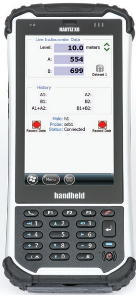
Model FPC-2 Field PC showing a Live Inclinometer Data reading screen shot.