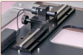
• Closeup of the Model 6850-10.