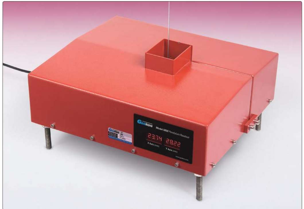
• Model 6850-4 Electronic Readout.