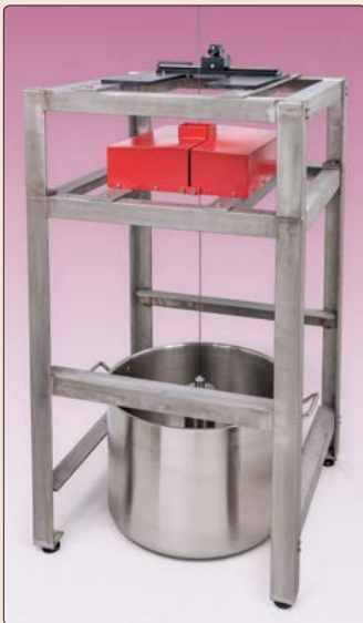
• Model 6850-10 Pendulum Optical Manual Readout with LED light beam, mounted above Pendulum electronics.