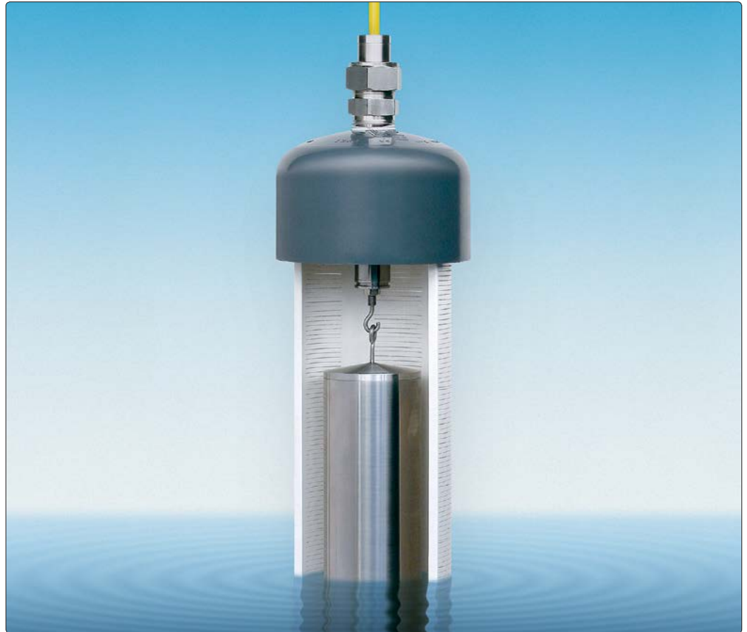
• The Model 4675LV with cutaway revealing its internal components: a cylindrical weight suspended from the vibrating wire force transducer.